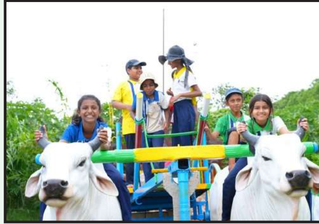
BULLOCK CART EXPLORATION