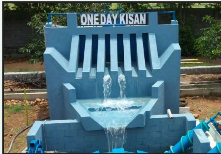
WORKING MODEL OF RESERVOIR