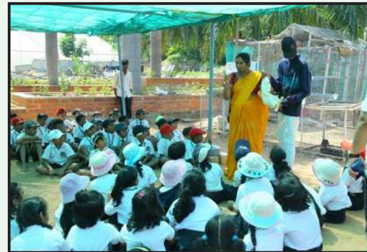
EXOTIC BIRDS & DOMESTIC ANIMALS