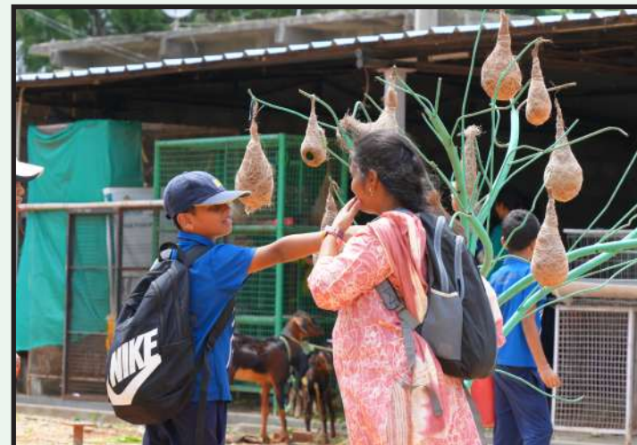
BIRD'S NEST EXPLORATION