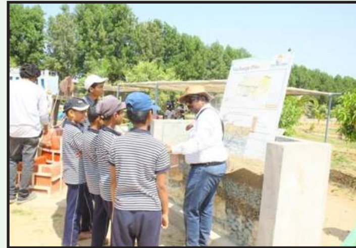
RAINWATER HARVESTING PIT