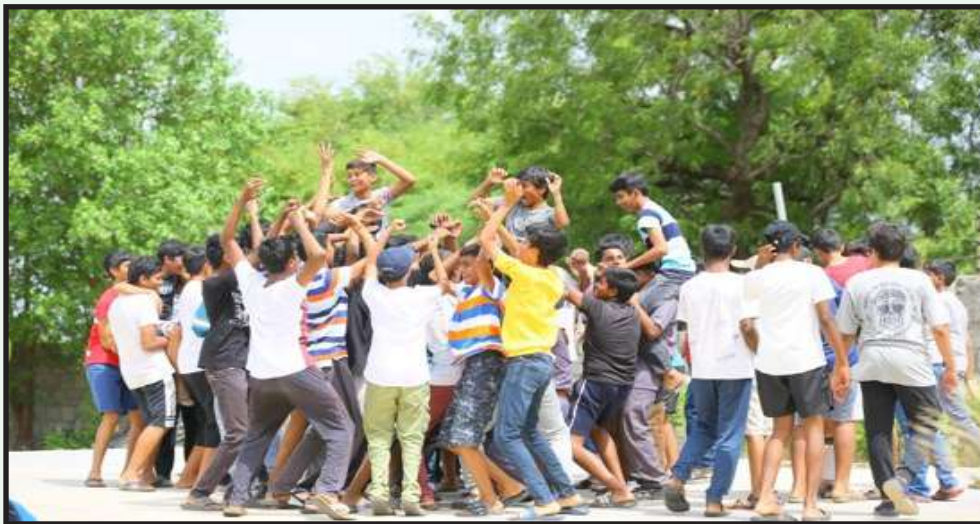
DJ MUSIC & DANCE