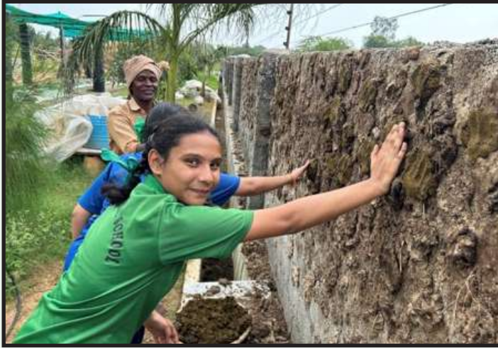
DUNG CAKE MAKING