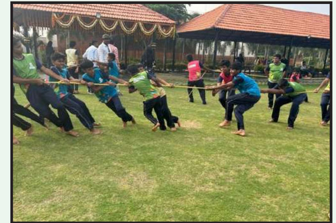
TUG OF WAR & FUN GAMES