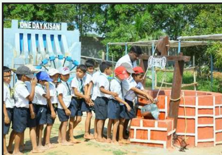
VINTAGE WATER WELL