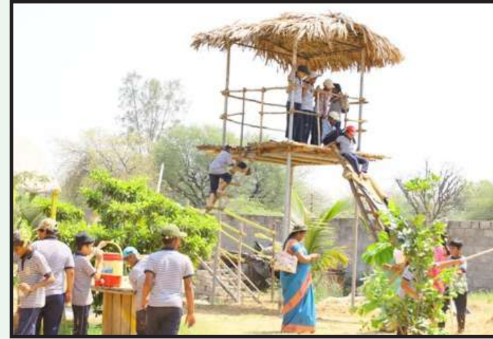
FARMER'S WATCH TOWER