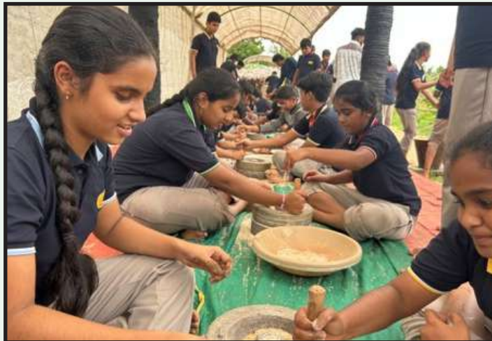
HAND GRINDING - 1