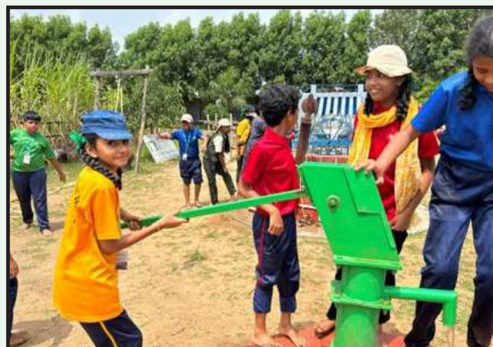
HAND BORE WELL