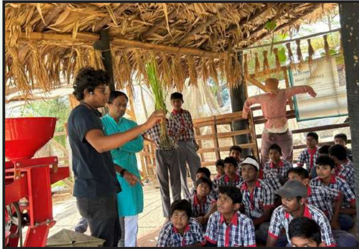
SHOWING PADDY SPROUTS TO MILLING PROCESS & IT'S BY-PRODUCTS DISPLAY AND USES